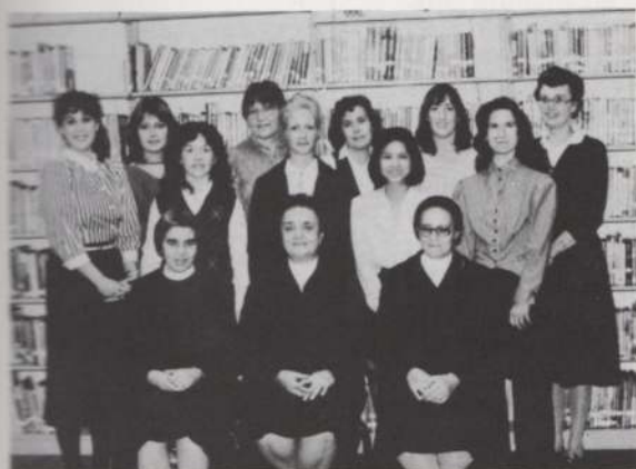
Faculty of Holy Innocents School