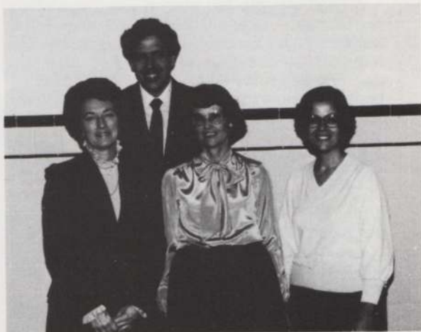
25th Anniversary Book Committee