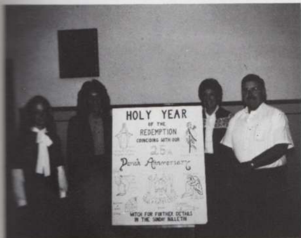
25th Anniversary Committee