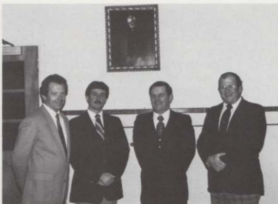
Holy Name Society officers