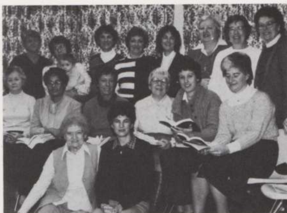
Bible Study group