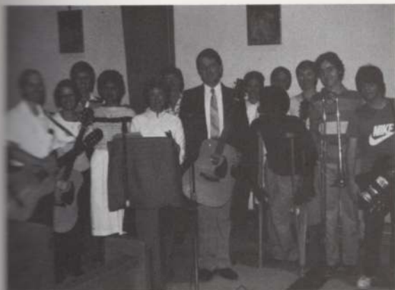
Folk Music Group