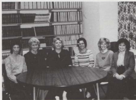
Holy Innocents School Librarians