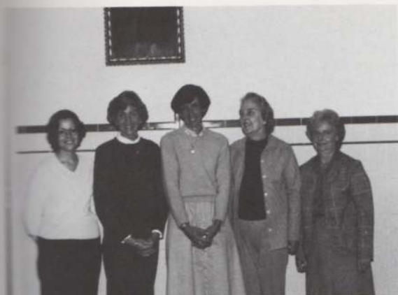
Rosary Altar Society officers, 1983