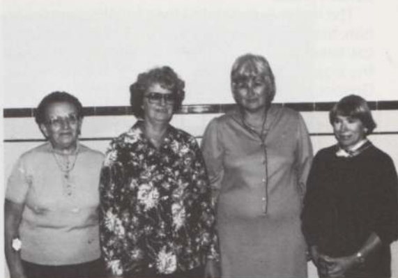
Legion of Mary officers