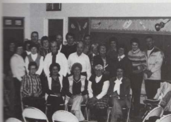
Living Witness Prayer group